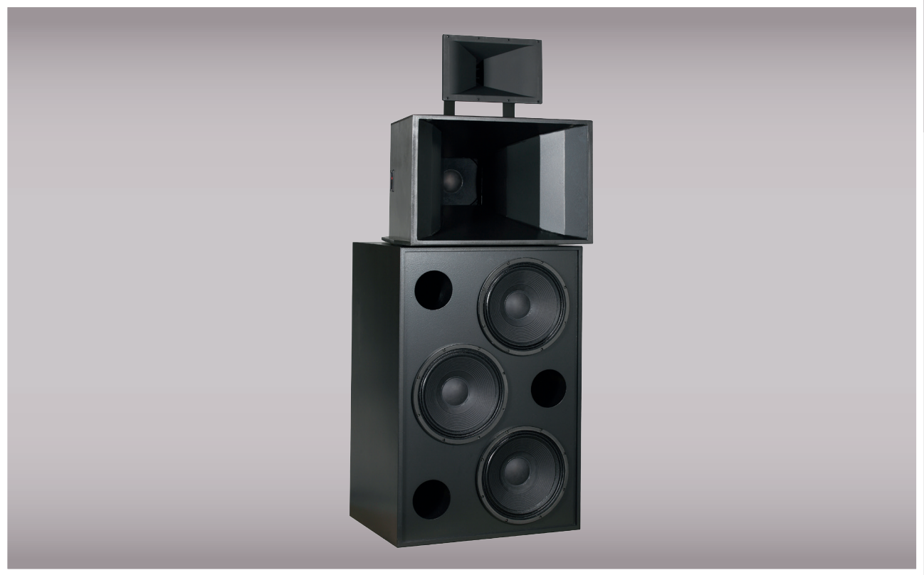
Modular cinema screen system